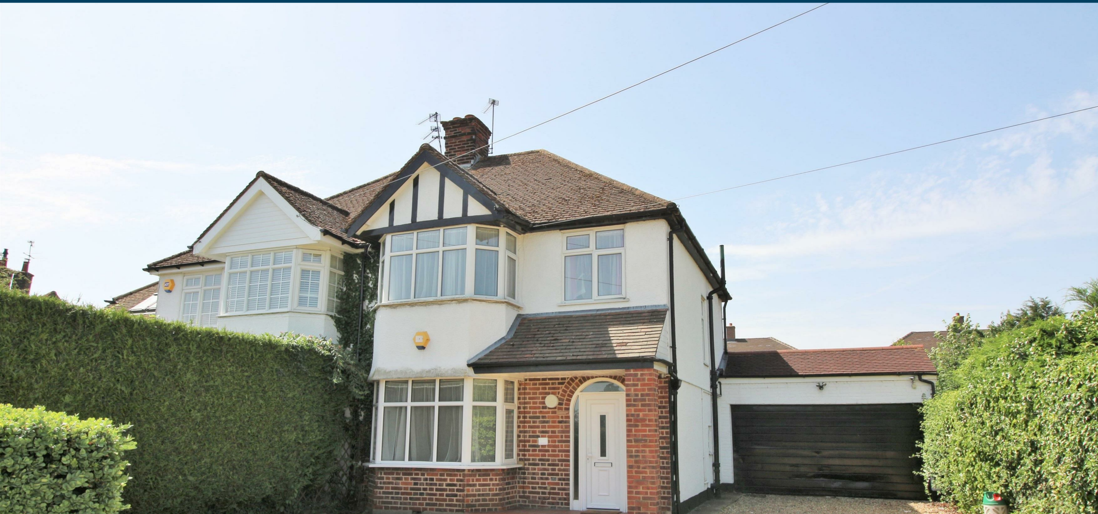
HILFIELD LANE, ALDENHAM GUIDE PRICE £800,000 FREEHOLD